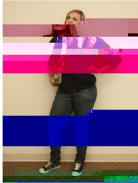
What NOT to Wear: Girls